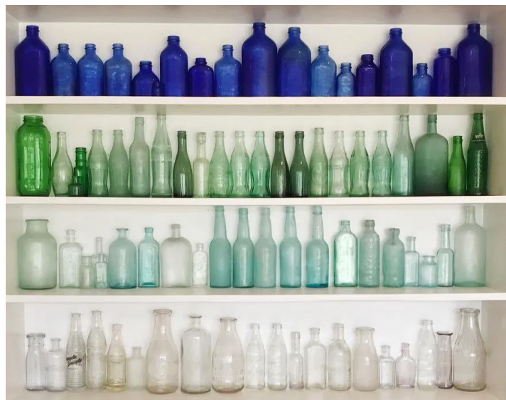
Photo of actual shelf and bottles

beauty. The immobilizing questions of life I was asking seemed to lose a bit of their bite in my trips to the dump.