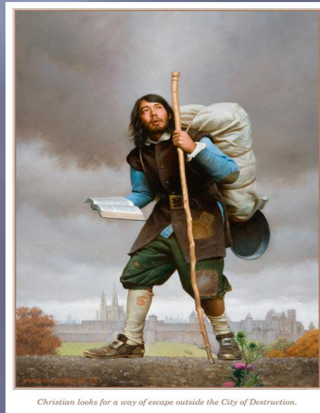
Christian looks for a way of escape outside the City of Destruction.

From the City of Humanity/Destruction to the City of God/Celestial City